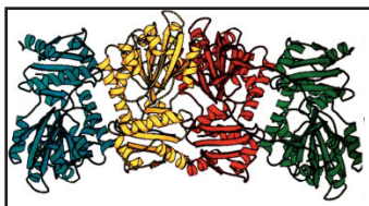
Crystal structure of tetrameric calsequestrin

These data are the first demonstrating the interplay of monovalent and divalent cations on the polymeric behavior of purified CSQ, strongly suggesting that CSQ polymerization is under dynamic regulation by mono- and divalent cations. Coincidentally, \text{Ca}^{2+} movement in and out of the SR is always accompanied by the opposing flux of monovalent cations.