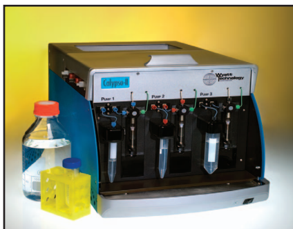
The Calypso Composition Gradient System